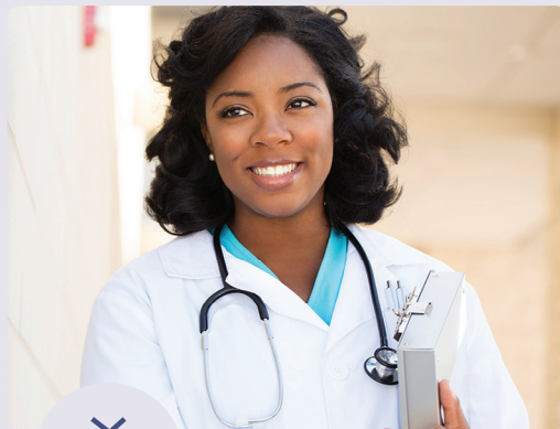
Short-term disability claim