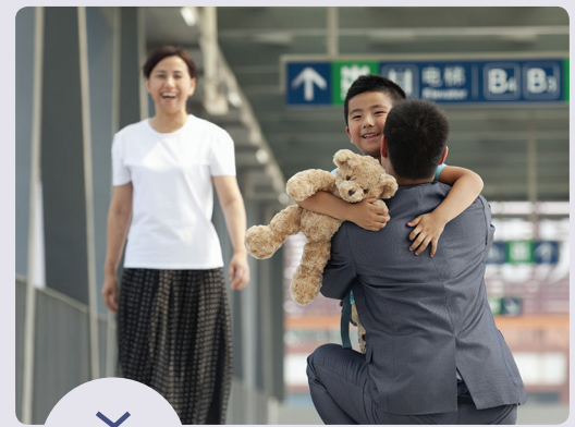
Adoption or foster care