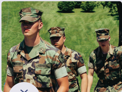
Care for an injured service member